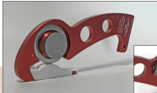
Model 06-601 / 07-701

Material Stainless steel, anodized aluminum and heat resistant plastic parts (up to 100 degrees C, 212 degrees F). Strong detergents may affect the anodized surface but will not affect the cutting performance.