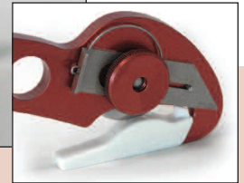
Model 06-601 with slitting function